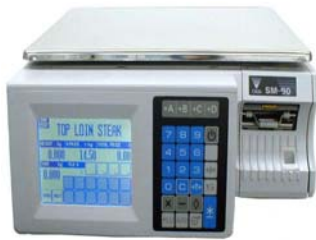
SM-90TB - Touch Screen