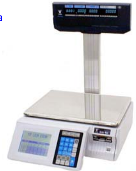
SM-90TP - Touch Screen with Post