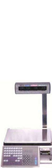
SM-90EP - Sequential Alpha-Numeric Post Display