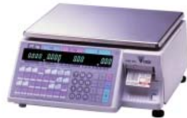
SM-90N - Numeric Display SM-90EB - Sequential Alpha Numeric Display