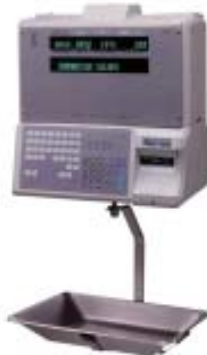
SM-90H - Simultaneous Alpha-Numeric Display